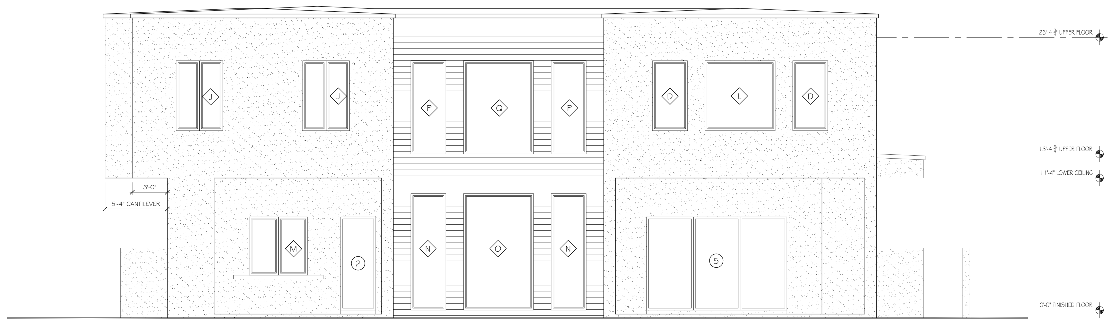
REAR ELEVATION SCALE: 1/4" = 1'-0"

CUSTOM DESIGN FOR THE: DESAI RESIDENCE 380 RIVERSIDE DRIVE ORMOND BEACH, FL 32176