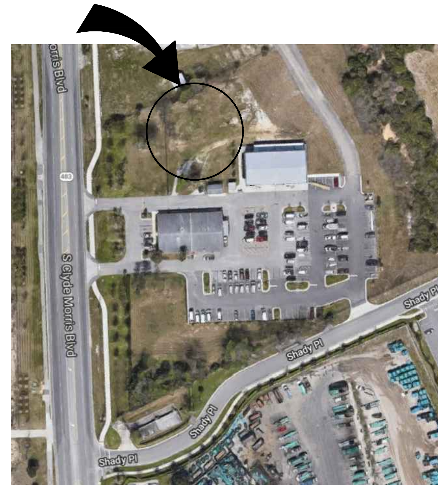
GENERAL PROJECT LOCATION DAYTONA BEACH, FL 32114-3900